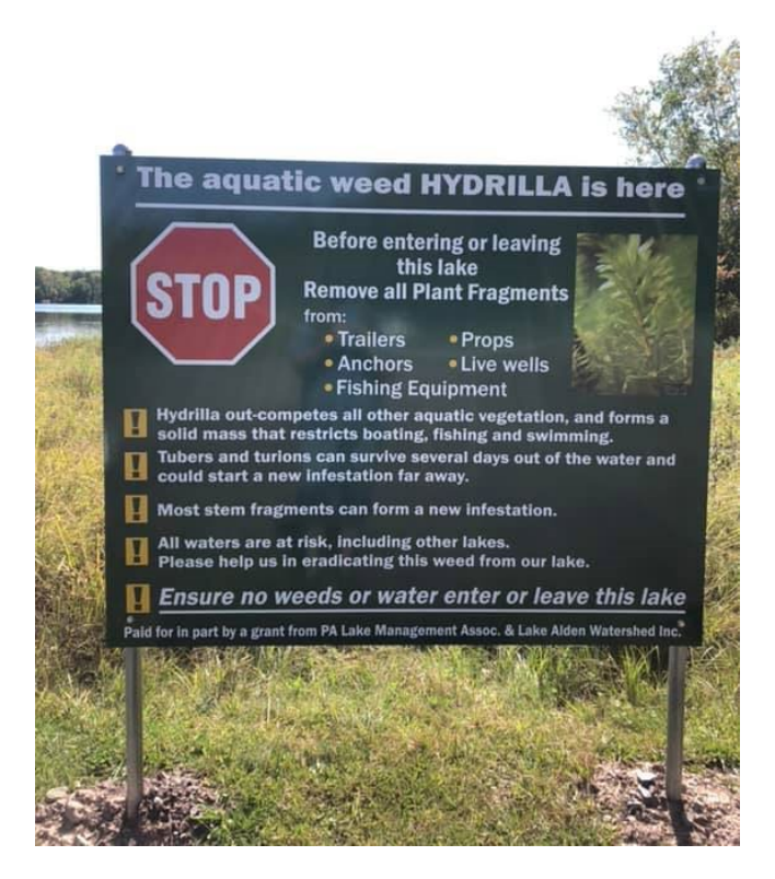
Signage to alert on the presence and prevention of AIS

Below you will find examples and resources for AIS prevention BMP's