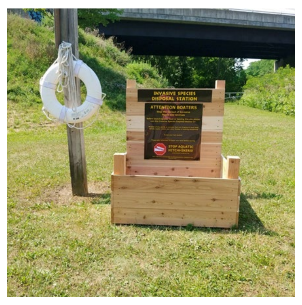
DIY Disposal Box

https://fingerlakesinvasives.org/aquatic-invasive-species-ais-disposal-station-instructions/